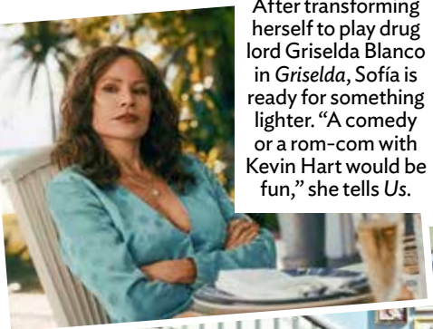
After transforming herself to play drug lord Griselda Blanco in Griselda , Sofia is ready for something lighter. "A comedy or a rom-com with Kevin Hart would be fun," she tells Us .